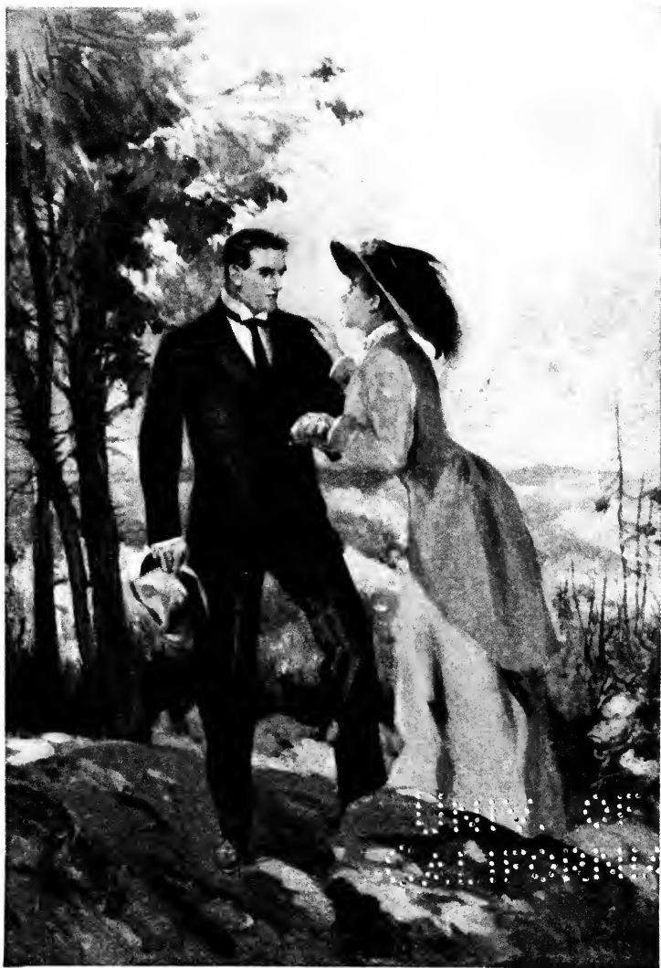
"Nan looked at him in despair"